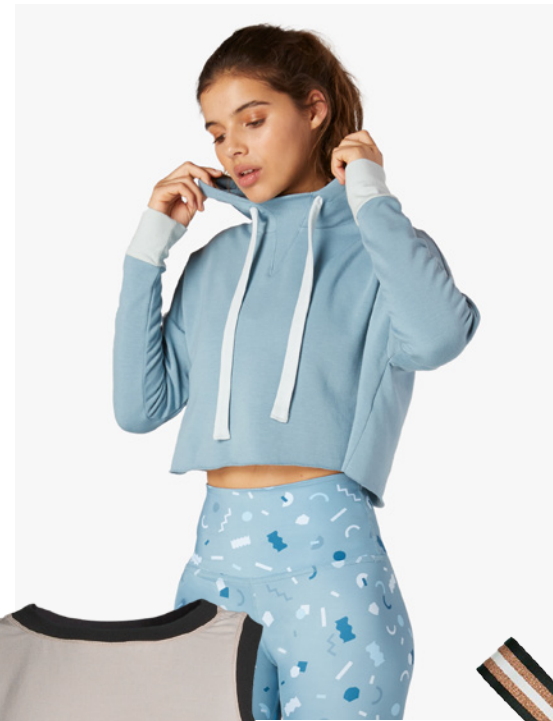
Beyond Yoga Poketo Crop & Lock It Hoodie and Lux Poketo High Waisted Long Legging, $110 and $88 , beyondyoga.com