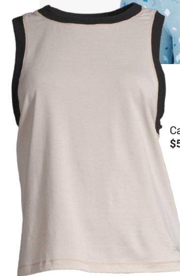
Casall Free Flex Tank, $56.75 , casall.com