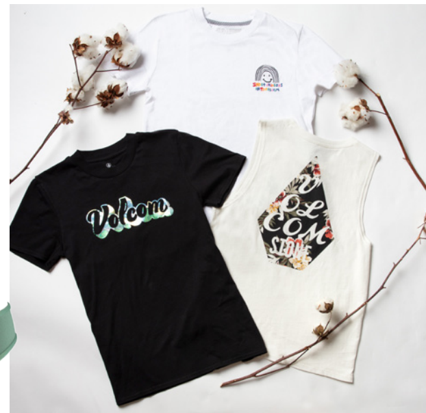
Volcom Farm-to-Yarn Stone Slick Tee and Love Tank, $27 and $25 , volcom.com