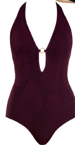
JETS Swimwear Australia Plunge One Piece, $168 , jetsswimwear.com