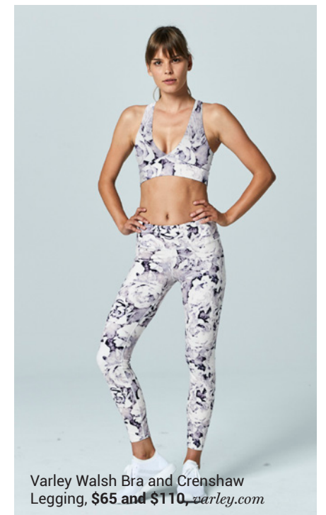
Varley Walsh Bra and Crenshaw Legging, $65 and $110 , varley.com