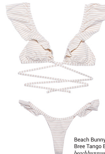
Beach Bunny Swimwear Scarlett Wrap Top and Bree Tango Bottom, $130 and $110 , beachbunnyswimwear.com