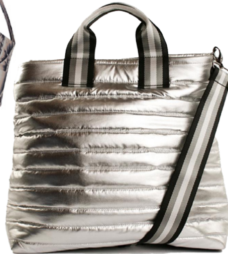
Think Royln The Editor Bag and 3-Ring Circus Set, $148 and $138 , thinkroyln.com