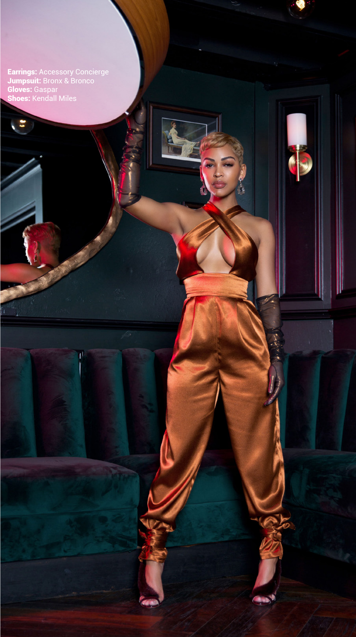
Earrings: Accessory Concierge Jumpsuit: Bronx & Bronco Gloves: Gaspar Shoes: Kendall Miles

—There are probably many things my people don't know about me. Oxtails are my favorite food. I have two hairless pet cats named Jackson and Malcom. I used to have two marmoset pet monkeys named Esther and Rocky. My favorite colors are black and sometimes gold. Every two years, I have a huge costume themed skate party on my birthday. I believe even the bad things you've experienced in life will be used for your good. I love driving and singing along to 90s rock 'n' roll over anything else. I've never liked the color pink, ever.