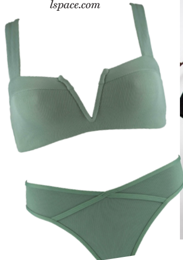
L*Space by Monica Wise Ribbed Lee Lee Bikini Top and Ribbed Fanning Bottom, $99 and $92 , lspace.com