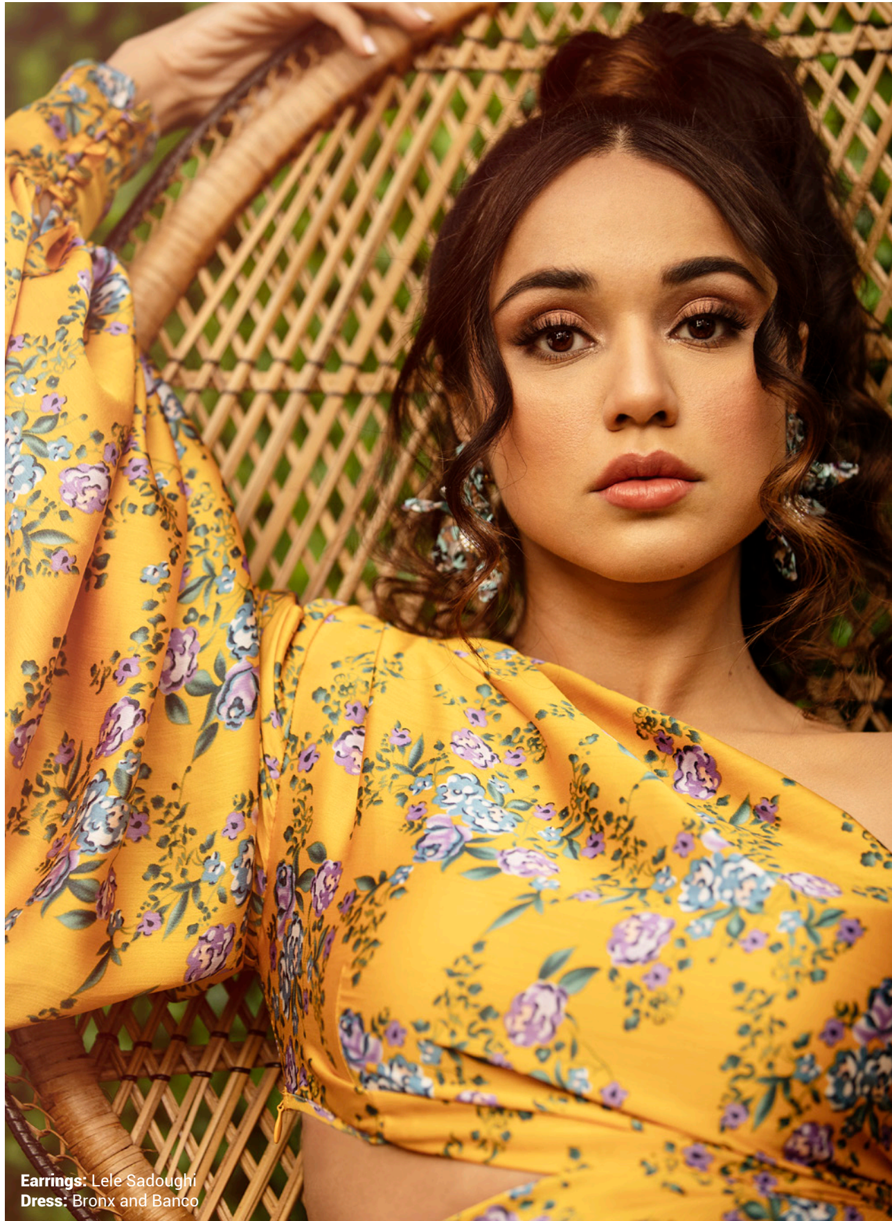
Earrings: Lele Sadoughi Dress: Bronx and Banco