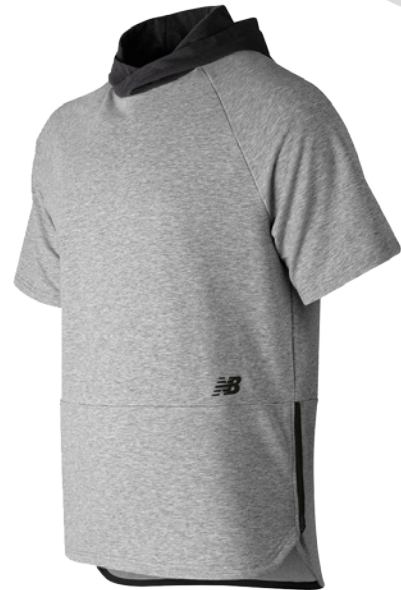
New Balance Men's R.W.T. Short Sleeve Hoodie, $64.99 , newbalance.com