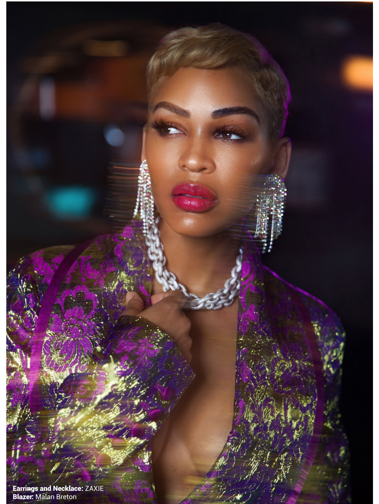
Earrings and Necklace: ZAXIE Blazer: Malan Breton

— At times it can be difficult when projects collide, but directing and producing is so incredibly fulfilling in a completely different way. As a producer, I love putting the pieces