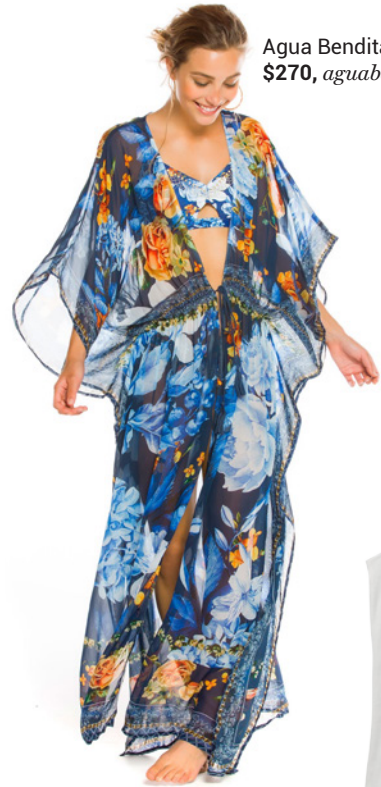
Agua Bendita Sam Athena Tunic, $270 , aguabendita.com