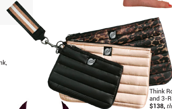
Think Royln The Editor Bag and 3-Ring Circus Set, $148 and $138 , thinkroyln.com