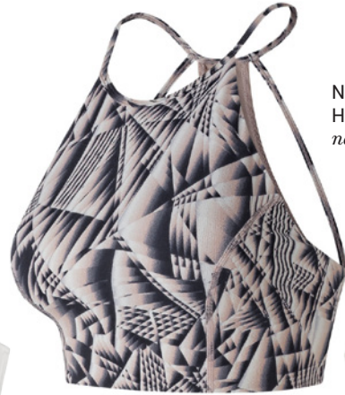
New Balance Printed Evolve Halter Crop, $64.99 , newbalance.com