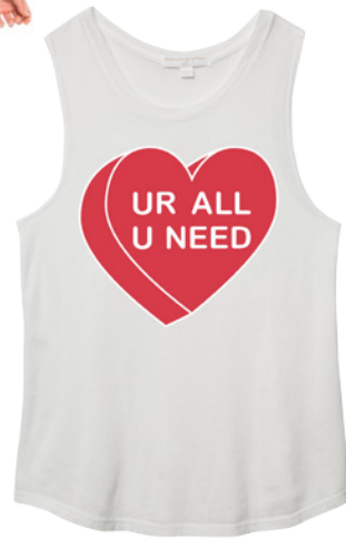
Amberella x Spiritual Gangster Muscle Tank, $48 , spiritualgangster.com