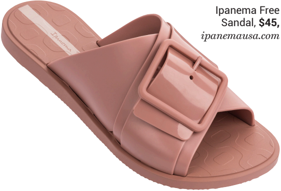
Ipanema Free Sandal, $45, ipanemausa.com