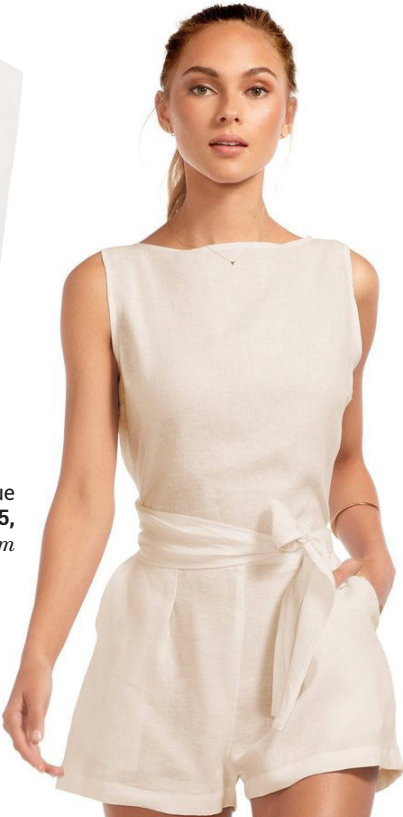
Vitamin A Martinique Romper, $125, vitaminaswim.com