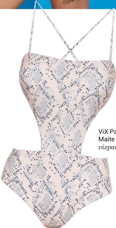
ViX Paula Hermannny Nusa Maite One Piece, $210 , vixpaulahermannny.com