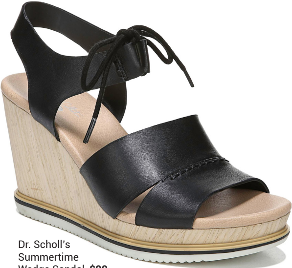
Dr. Scholl's Summertime Wedge Sandal, $90, drschollsshoes.com