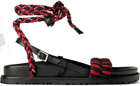
Zara Woven Flat Sandal, $89.90, zara.com