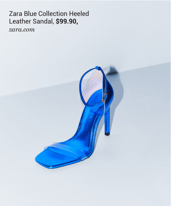
Zara Blue Collection Heeled Leather Sandal, $99.90, zara.com