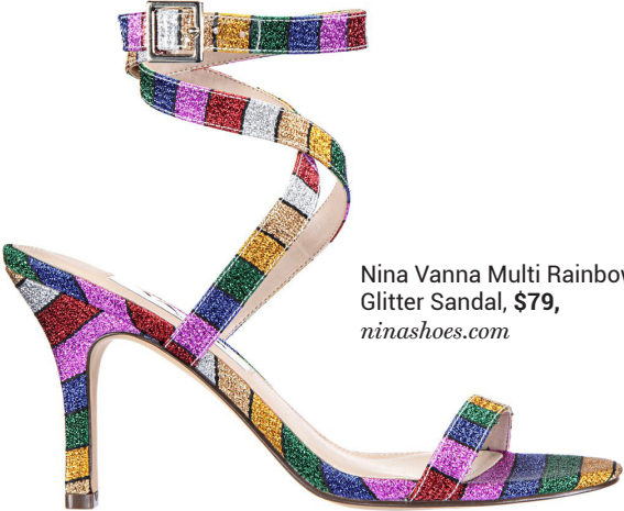
Nina Vanna Multi Rainbow Glitter Sandal, $79, ninashoes.com