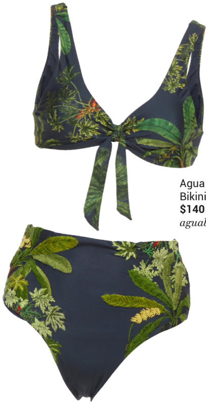
Agua Bendita Grace Printed Bikini Top and Bottom, $140 and $135 , aguabendita.com