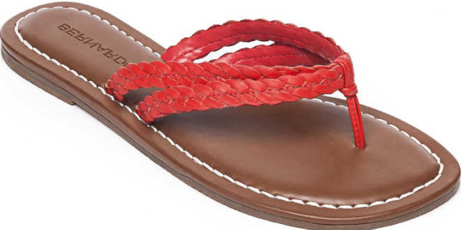
Bernardo 1946 Mariah Sandal, $69, bernardo1946.com