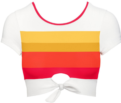
Robin Piccone Stripe Bikini Tee, $118 , robinpiccone.com