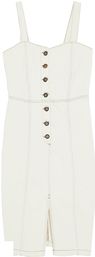
Zara Denim Overall Dress with Topstitching, $29.90, zara.com