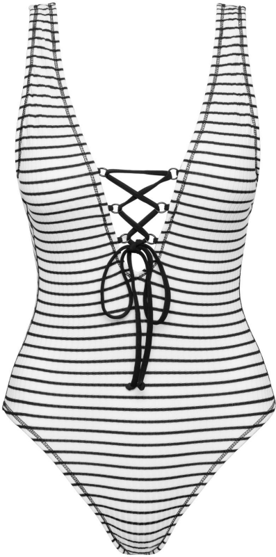
Robin Piccone Sailor Stripe Lace Up One Piece, $148 , robinpiccone.com