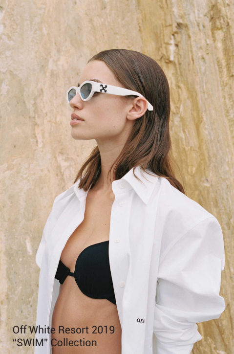
Off White Resort 2019 "SWIM" Collection

SPEND THE SEASON WEARING OUR FAVORITE NEUTRAL!