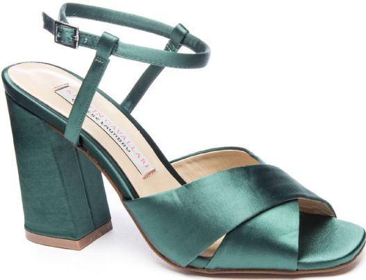
Kristin Cavallari Low Light Block Heel Sandal, $130, chineselaundry.com