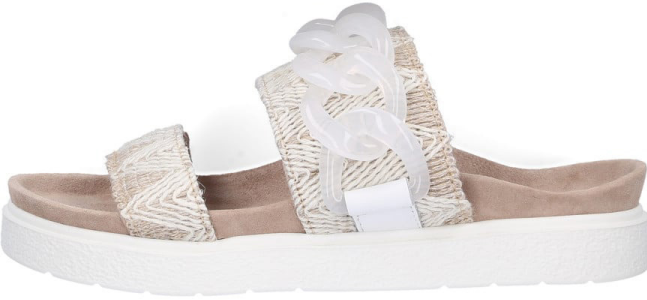
INUIKII Velvet Decorative Chain Sandal, $337, inuikii.com