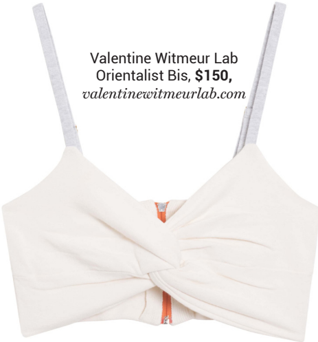
Valentine Witmeur Lab Orientalist Bis, $150, valentinewitmeurlab.com