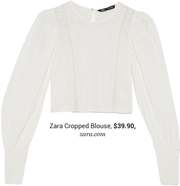
Zara Cropped Blouse, $39.90, zara.com