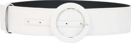
Attico White Belt, theattico.com