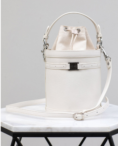
Kestan Burke Crossbody Bucket in Cream, $135, kestan.co