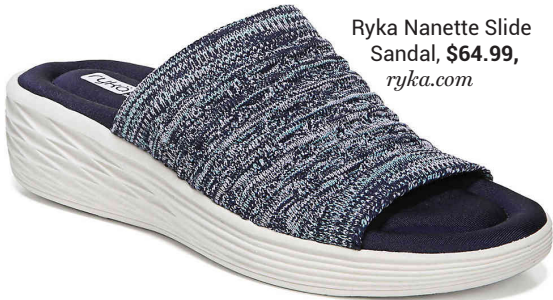
Ryka Nanette Slide Sandal, $64.99, ryka.com