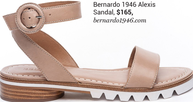
Bernardo 1946 Alexis Sandal, $165, bernardo1946.com