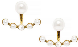
Maison Miru Octavia Ear Jackets, $89, maisonmiru.com