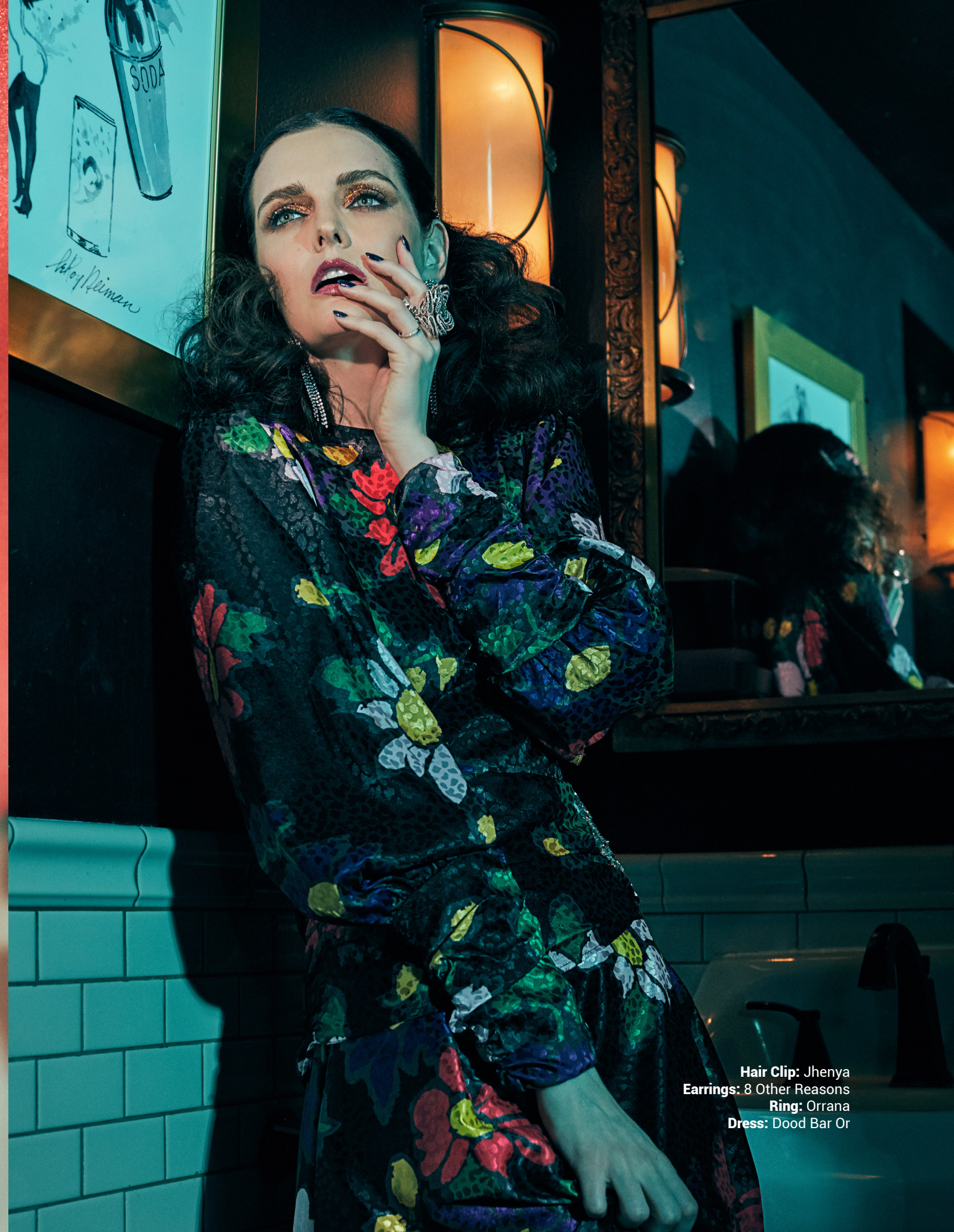
Hair Clip: Jhenya Earrings: 8 Other Reasons Ring: Orrana Dress: Dood Bar Or