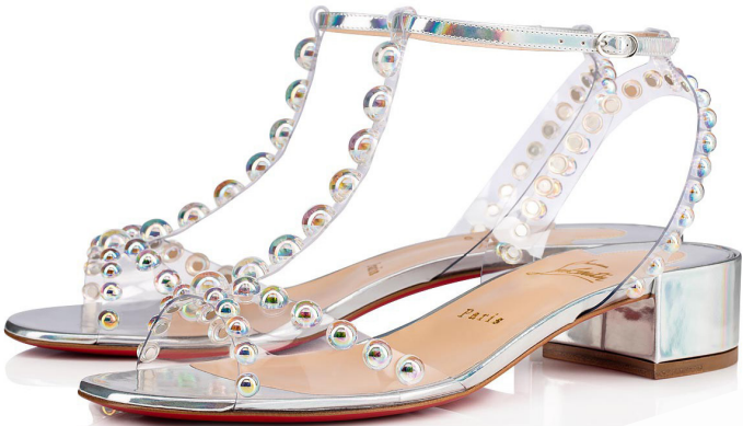
Christian Louboutin Faridaravie, $775, us.christianlouboutin.com

SLIP INTO SUMMER WEARING OUR FAVORITE FINDS—PLUS, BUDGET-WORTHY OPTIONS!