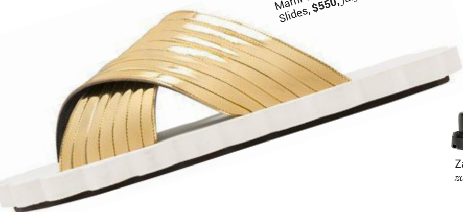
Mami Crossover Strap Slides, $550, farfetch.com