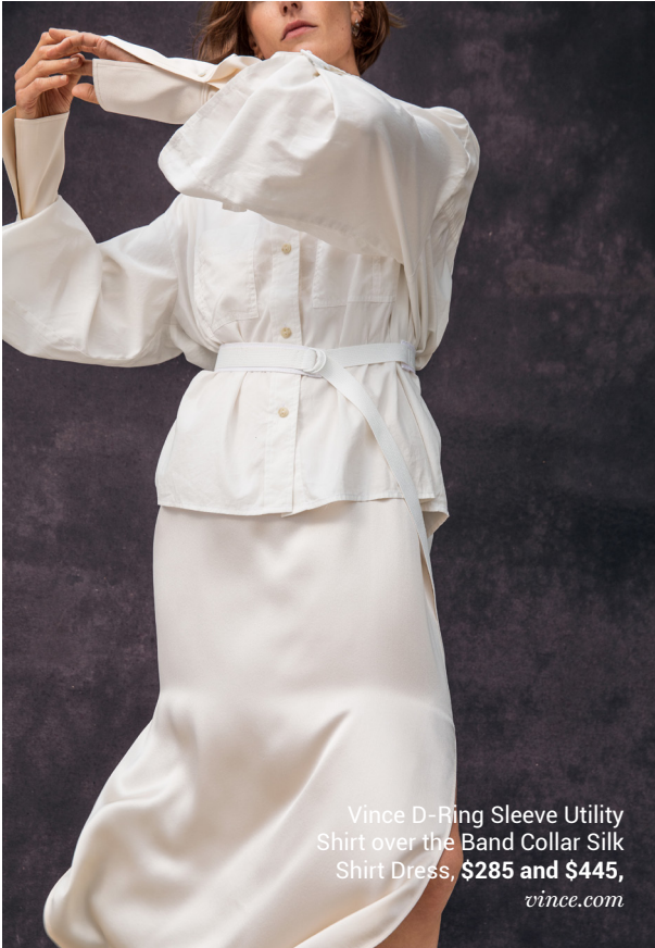
Vince D-Ring Sleeve Utility Shirt over the Band Collar Silk Shirt Dress, $285 and $445, vince.com