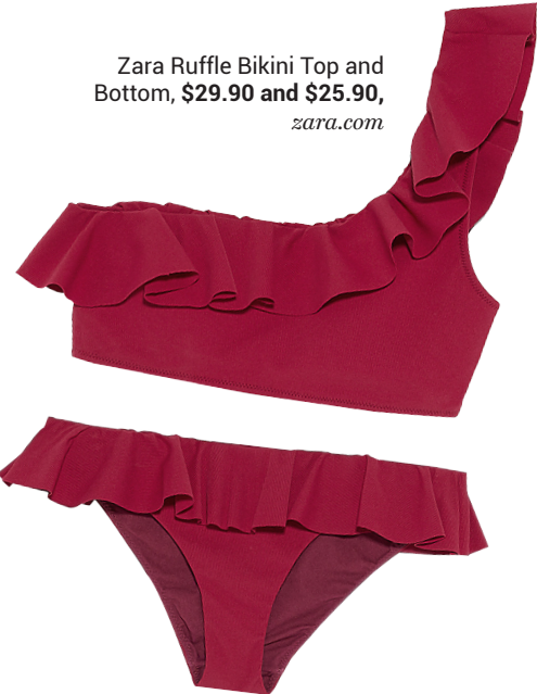
Zara Ruffle Bikini Top and Bottom, $29.90 and $25.90 , zara.com