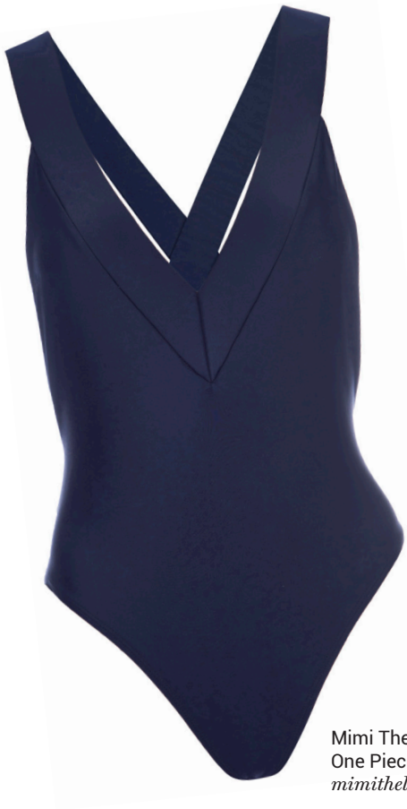
Mimi The Label The Florence One Piece Swimsuit, $230 , mimithelabel.com